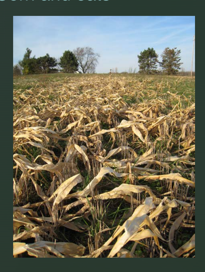
Corn and oats